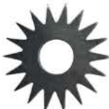
STEEL CUTTERS POINTED 18 Pt Part# 20236 (6 Shaft Drum)