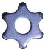
CARBIDE CUTTERS 6 Pt Part# 20156 (6 Shaft Drum)