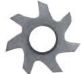
CARBIDE MILLING CHUNKER 7 Pt Part# 20336 (8 Shaft Drum)