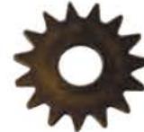
STEEL CUTTERS POINTED 18 Pt Part# 20296 (6 Shaft Drum)