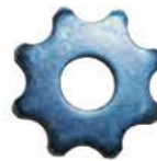
CARBIDE CUTTERS 8 Pt Part# 20326 (6 Shaft Drum)