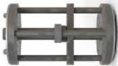
CPU-10 DRUM Part# 64420 (4 Shaft Drum)