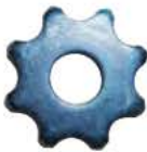
CARBIDE CUTTERS 8 Pt Part# 20326 (6 Shaft Drum)