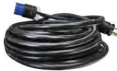
TWIST LOCK POWER CORD Part# 101270